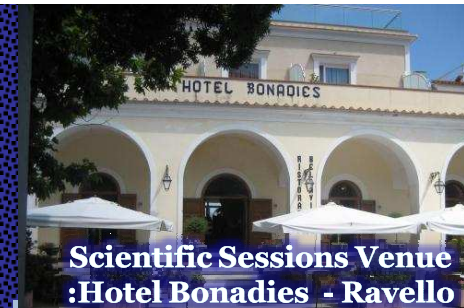
Scientific Sessions Venue :Hotel Bonadies - Ravello